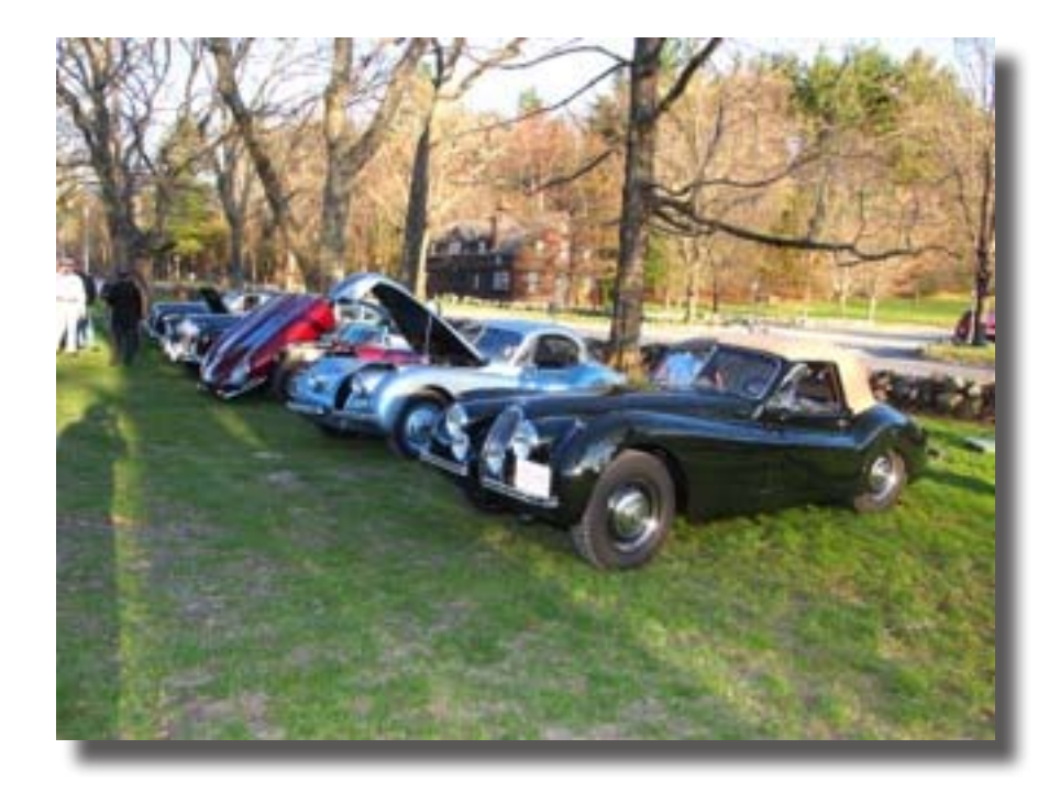
Spring was definitely in the air, it brought out many members and their sweet rides to the April meeting. Here the Wayside Inn's lawn holds several Jags in various states of being examined.